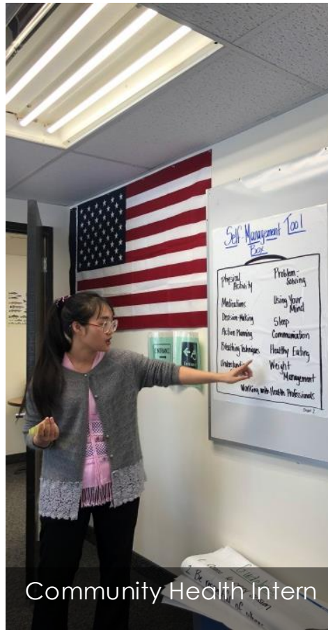
Community Health Intern